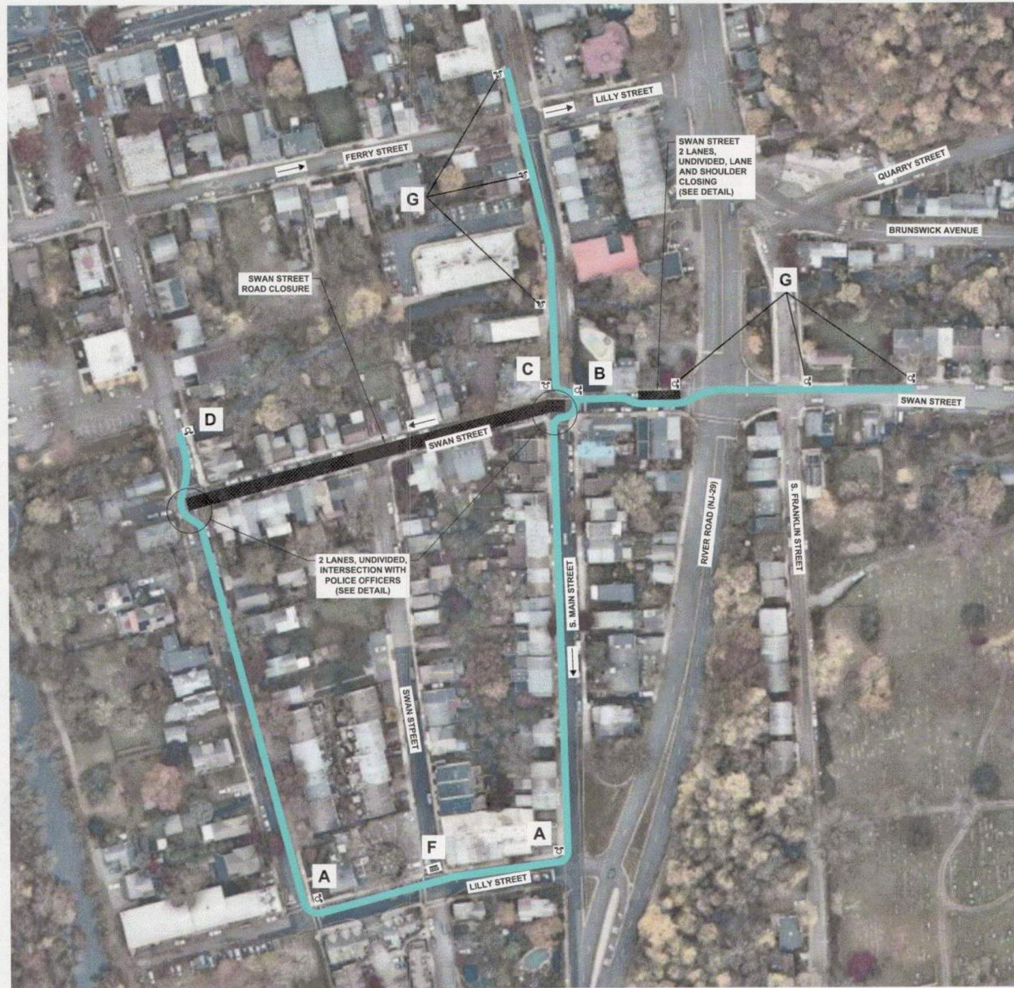
SWAN STREET TRAFFIC DETOUR PLAN I SCALE: 1" = 80'

E:\SCE\Lambertville\10130 Sewer Rehabilitation\Sheets\10130.021 07-10 Traffic Detour Plans.dwg Fri, Mar 29, 2019 - 2:10pm JFowler SUBURBAN CONSULTING ENGINEERS, INC.