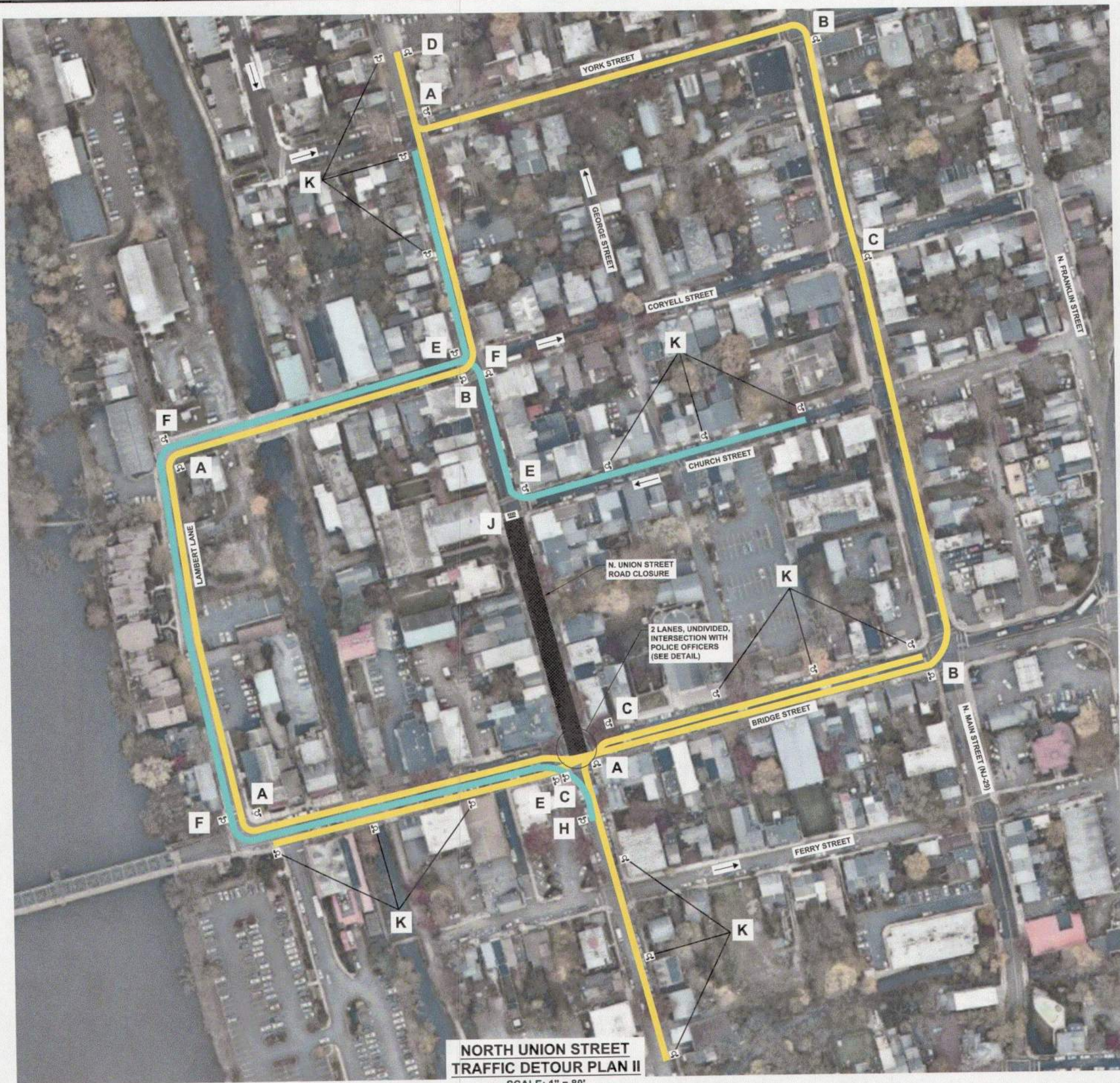
NORTH UNION STREET TRAFFIC DETOUR PLAN II SCALE: 1" = 80'

E:\SCE\Lambertville\10130 Sewer Rehabilitation\Sheets\10130.021 07:10 Traffic Detour Plans.dwg Fri, Mar 29, 2019 - 2:46pm jfowler - SUBURBAN CONSULTING ENGINEERS, INC.