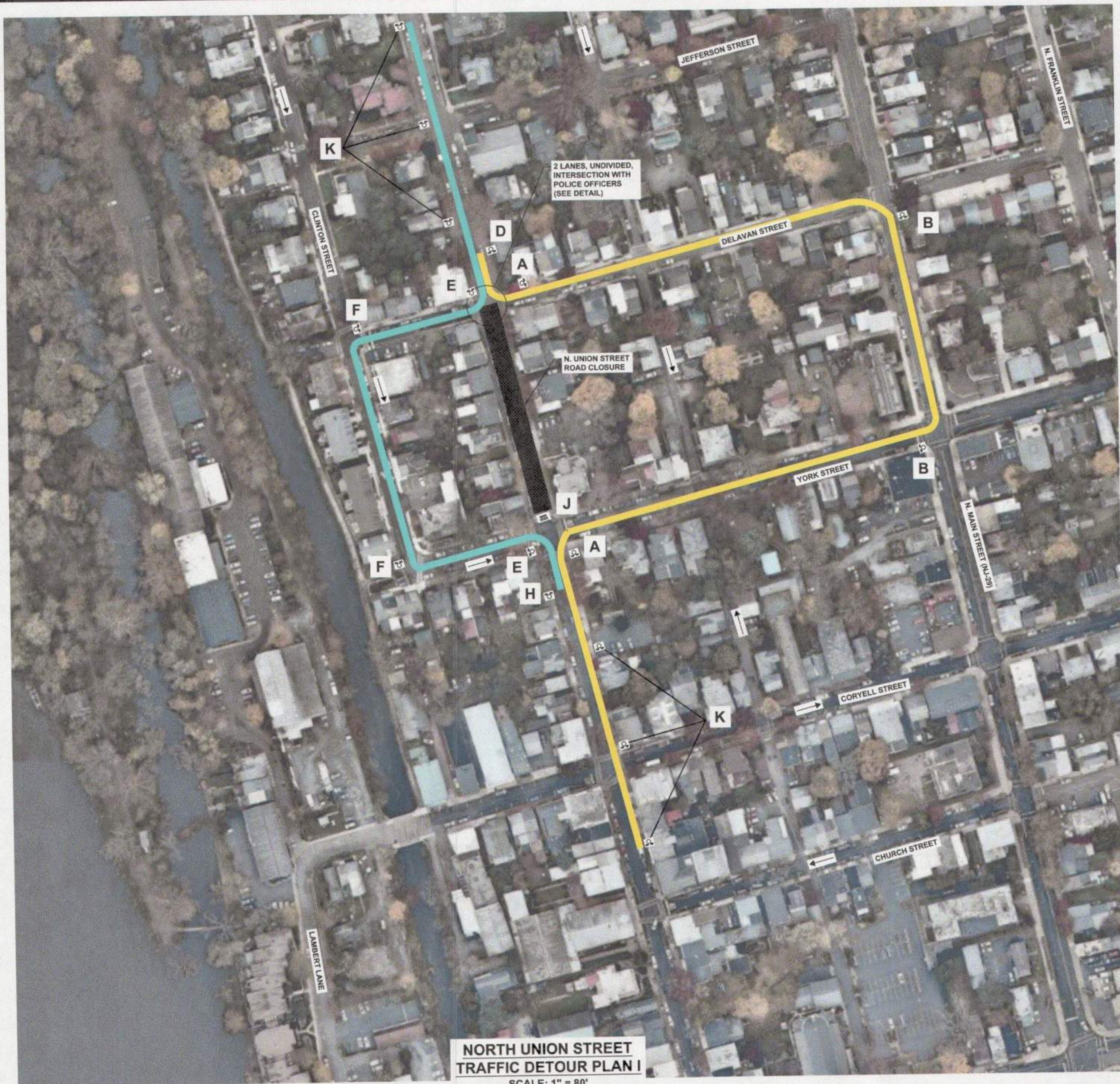
NORTH UNION STREET TRAFFIC DETOUR PLAN I SCALE: 1" = 80'

E:\SCE\10130 Lambertville\10130 Sewer Rehabilitation\10130.021 07-10 Traffic Detour Plans.dwg Fri, Mar 29, 2019 - 3:38pm jflowler SUBURBAN CONSULTING ENGINEERS, INC.